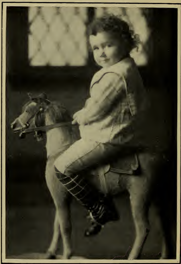
A FEARLESS HORSEMAN